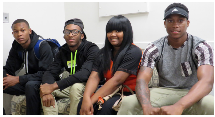
Some of our Youthworks students in Administration and Facilities Maintenance